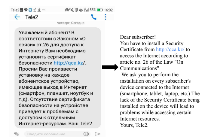
Figure 1: Kazakh users were directed to install a "security certificate"—a custom CA used to intercept HTTPS connections to popular sites. ⋄

the browser remembers which certificates belong to each domain after first use, was adopted by major browsers in the past but is no longer supported [34]. Far more successful has been Certificate Transparency (CT) [28], which records certificates in a public ledger so that misissuance is at least detectable; Chrome now requires certificates from public CAs to be logged to CT. However, since the Kazakhstan attack involved users manually installing a custom CA, none of these proposals would prevent it.