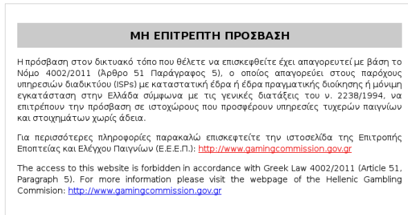
Figure 2: Blocked Webpage Screenshot